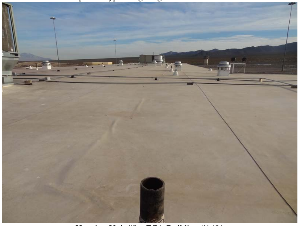
Housing Unit #8 – FCA Building #1481 Description: 14 year old single-ply roof membrane.

Housing Unit #8 – FCA Building #1481 Description: Typical lighting and electrical in cells.