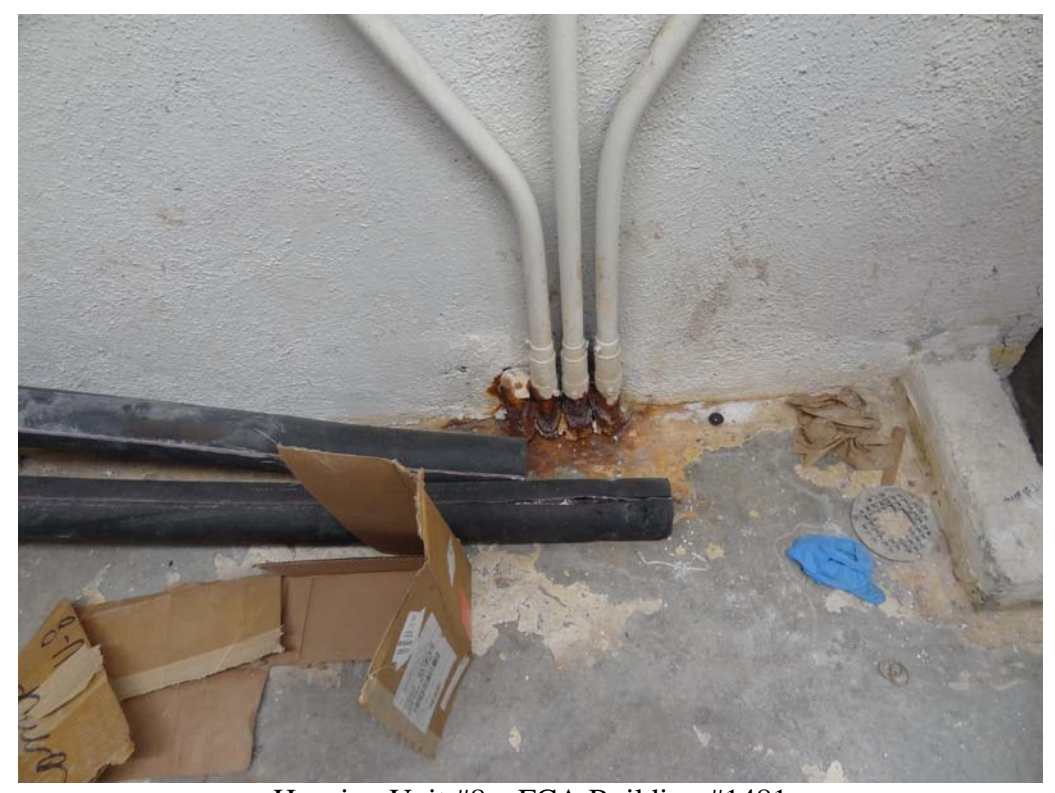
Housing Unit #8 – FCA Building #1481 Description: Rusted electrical conduit in Mechanical Room.