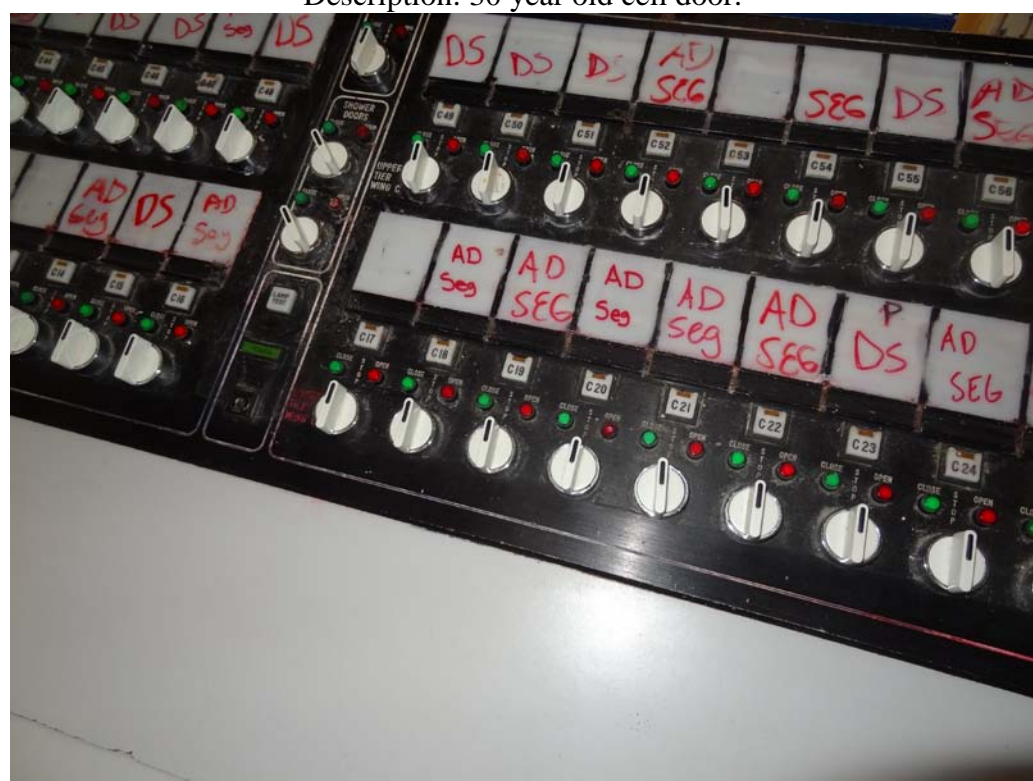
Housing Unit #8 – FCA Building #1481 Description: 30 year old cell door control panel.

Housing Unit #8 – FCA Building #1481 Description: 30 year old cell door.