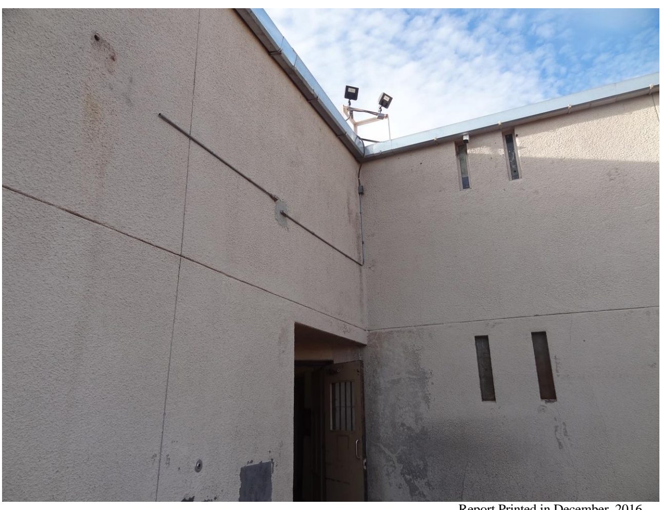
Report Printed in December 2016