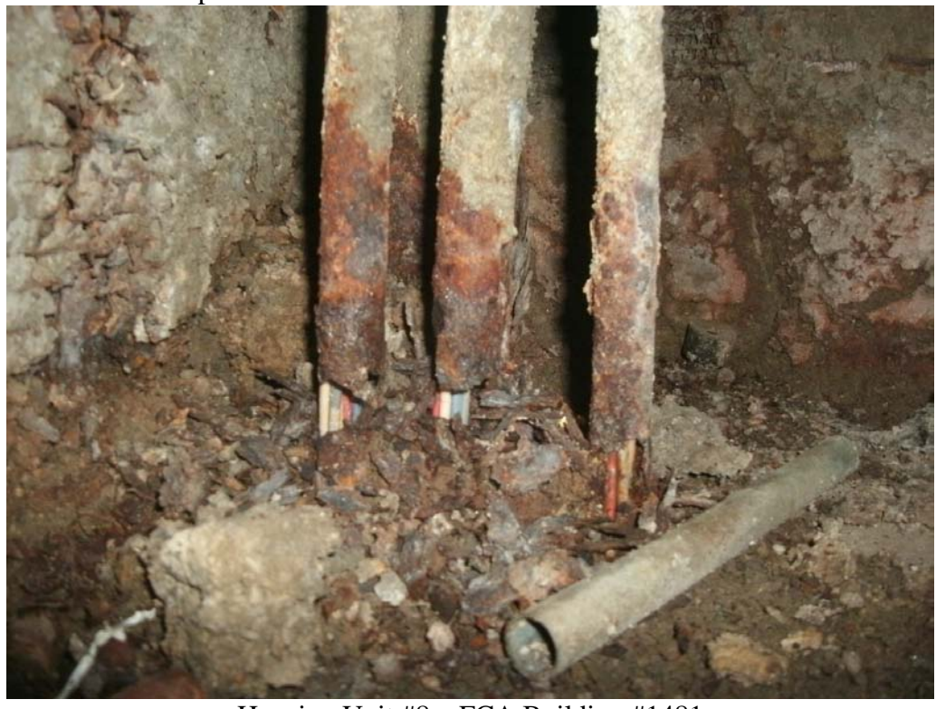
Housing Unit #8 – FCA Building #1481 Description: Rusted electrical conduit in utility chase.