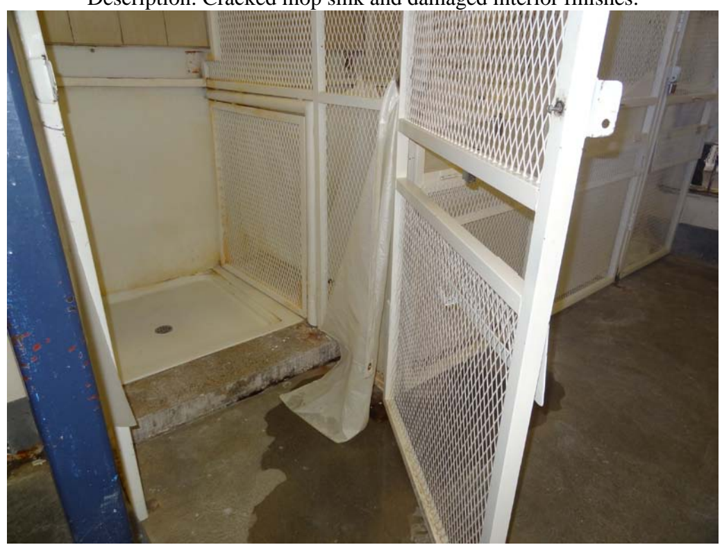
Housing Unit #8 – FCA Building #1481 Description: Typical shower enclosure.

Housing Unit #8 – FCA Building #1481 Description: Cracked mop sink and damaged interior finishes.