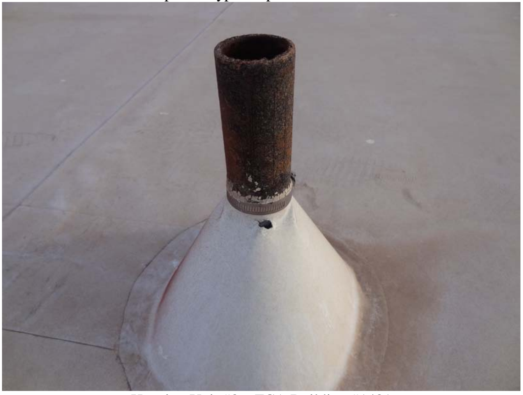
Housing Unit #8 – FCA Building #1481 Description: Typical roof penetration with deteriorated sealants and punctures in the membrane.

Housing Unit #8 – FCA Building #1481 Description: Typical sprinkler head in cell.