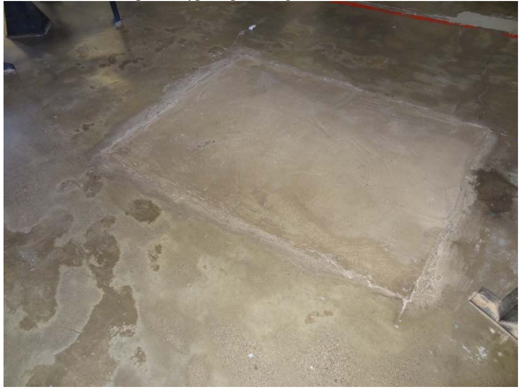
Housing Unit #8 – FCA Building #1481 Description: One of several areas of concrete removal and replacement to access clogged sewer piping.

Housing Unit #8 – FCA Building #1481 Description: Typical plumbing chase between cells.