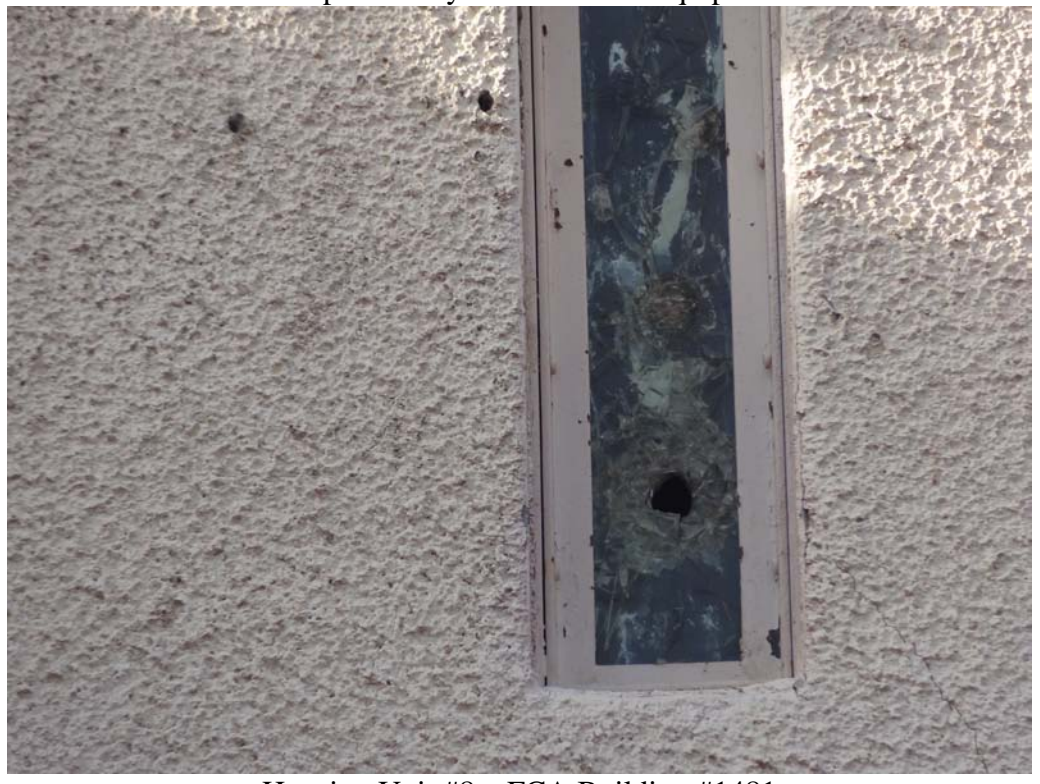
Housing Unit #8 – FCA Building #1481 Description: Typical cell window.

Housing Unit #8 – FCA Building #1481 Description: 30 year old HVAC equipment.